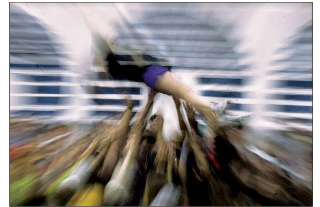
A girl gets hoisted into the air during the last 15 minutes of Thon.