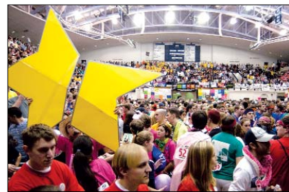
The crowd cheers during the final hours of Thon.

Seven hundred dancers stood for two days to raise over $4 million dollars, the most money raised in Thon history. Through two days of pain, tears, happiness and laughter, Penn State students showed they were embracing dreams and sharing tomorrow. Here are some captured moments from those 48 hours.